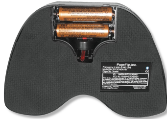
Figure 2: Battery cover is located at the bottom of the PageFlip Cicada. A convenient storage compartment for an optional Bluetooth dongle lies alongside the batteries.

Note: To conserve battery power, turn off device when not in use. The unit automatically turns off after 30 minutes of inactivity, but can awake instantly upon a pedal tap. Pedal versions prior to V5 have a timeout period of 10 minutes, rather than 30 minutes.