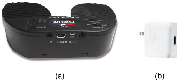
Figure 3: (a) Rear view of PageFlip Cicada. Attach the mini-USB end of the 6' USB power cable into the rear POWER outlet and connect the other end into (b) any USB AC adapter, such as those found on iPads and iPhones.

In addition to being battery-operated, PageFlip Cicada may also be plugged into the wall via a USB AC adapter. For added versatility, the pedal may be powered by connecting it directly to the USB port of a computer. A USB power cable (Fig. 1) is included for use with any USB AC adapter, such as those included with iPads and iPhones (Fig. 3(b)). Simply plug one end of the power cable into the mini-USB outlet on the rear of the PageFlip Cicada (Fig. 3(a)) and plug the other end into the USB AC adapter.