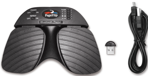
Figure 1: Package contents: PageFlip Cicada and USB power cable.