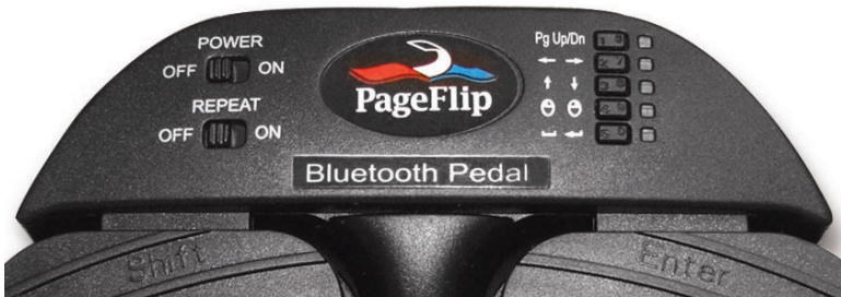
Figure 4: Top view of PageFlip Cicada control panel.